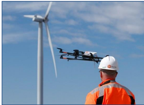
Drone Infrastructure Inspection