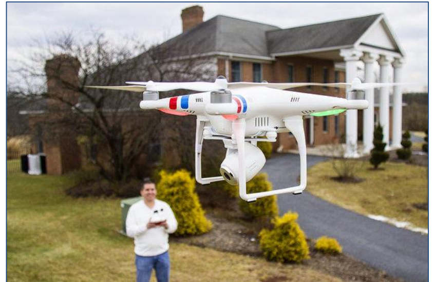
Real-estate drone photography is booming

* FAA is no longer issuing 333 unless your drone is over 55 lbs.